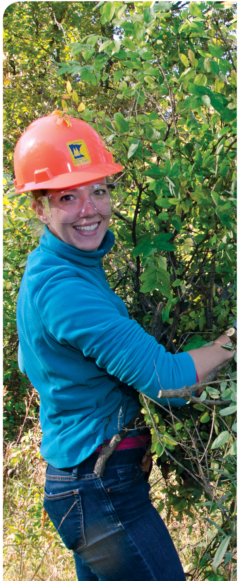
A volunteer performing invasive specie control by removing buckthorn at Grey Cloud Dunes Scientific and Natural Area (SNA).