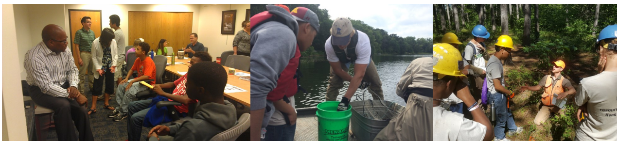
connected crew members to DNR staff at office meet-ups and in the field