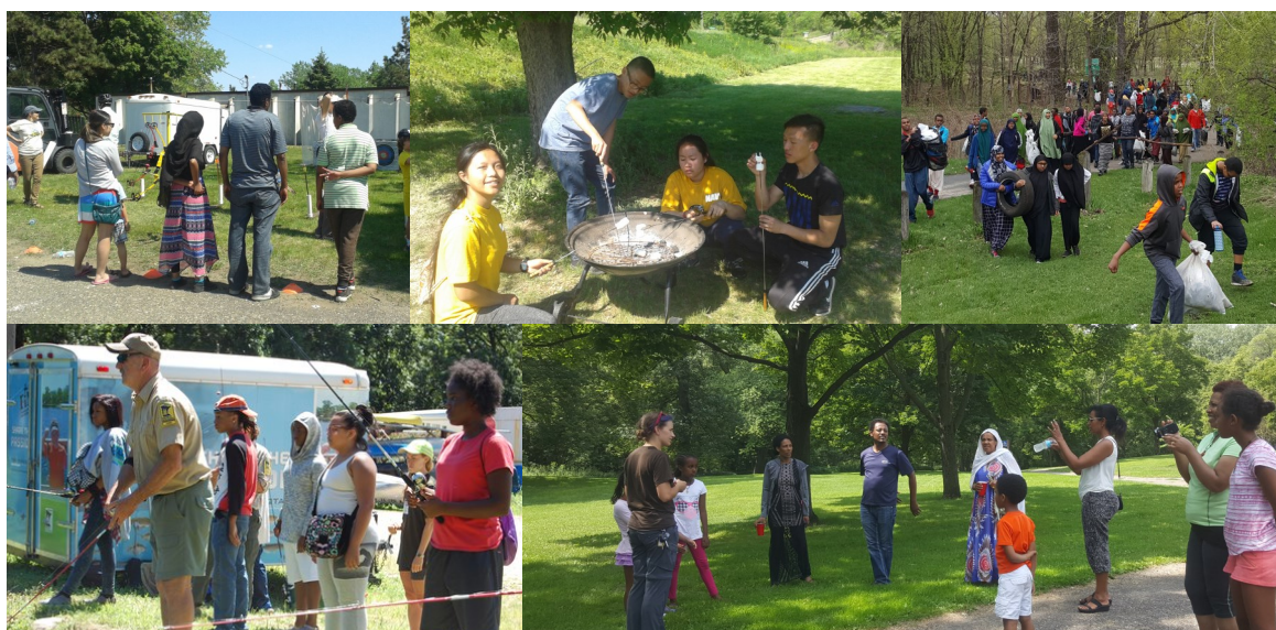
connected under-represented youth and families to natural resource projects, outdoor recreation opportunities and career information