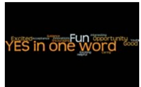
Word cloud generated by activity

The 23 YES! coaches in attendance gathered while the students were engaged in initiative games to share best practices for fundraising, recruitment of new students and how to manage multi-year projects while giving new students the opportunity to start new projects of interest to them. Resources from YES! were also shared to kick off the new 2015-16 season.