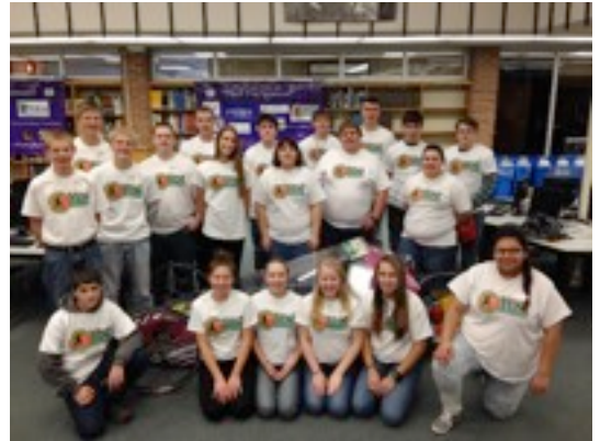
GSL and MNCS YES! Teams