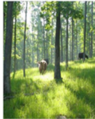
Figure 3. Managed Woodland Grazing through the application of silvopasture principles.