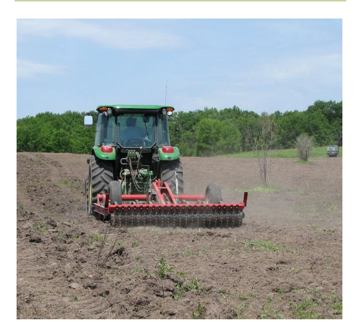
What is the Environment and Natural Resource Trust Fund (ENRTF)? ENRTF is a constitutionally dedicated fund for natural resources that originates from a combination of Minnesota State Lottery proceeds and investment income.

What is Ecological Restoration? It's the process of assisting the recovery of an ecosystem that has been degraded, damaged, or destroyed.