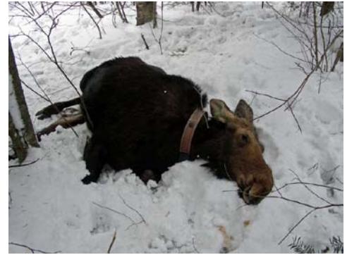
A radio-collared moose from a past study that died, and researchers were unable to respond in time to determine the specific cause.

Proposed study area for determining specific causes of non-hunting mortality in northeastern moose. This area intentionally overlaps with previous and current moose research projects that focused primarily on how moose use their habitats, yet these studies were unable to determine causes of mortality. By building this mortality study on the foundation of previous research, we hope this sheds more light as to why the moose population is in decline. Further, this area is also larger than previous study sites, as recommended by the MAC committee, to encompass potential geographic variations in moose mortality.