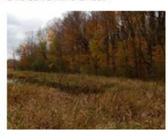
The shallow wetlands on Joan's property are part of a major migratory route for waterfowl and sonabirds.

The natural and undisturbed forests, grasslands and wetlands of this property create attractive habitat to support a wide range of species such as bald eagle, common tern, osprey, wood turtle, trumpeter swan, yellow rails and sharptailed sparrow. It is part of a major migratory corridor for waterbirds and serves as one of the state's most critical areas for spotted salamander and other amphibians.