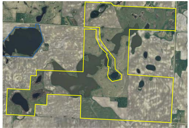
Seter-Davis WPA – 466 acres