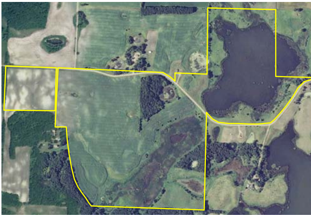
Whiskey Lake WPA – 73 acres