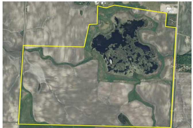
Lake Park WPA – 774 acres