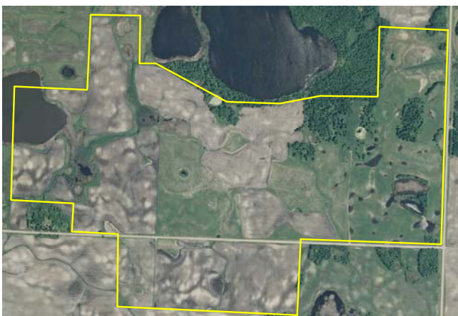
Kruger WPA – 630 acres