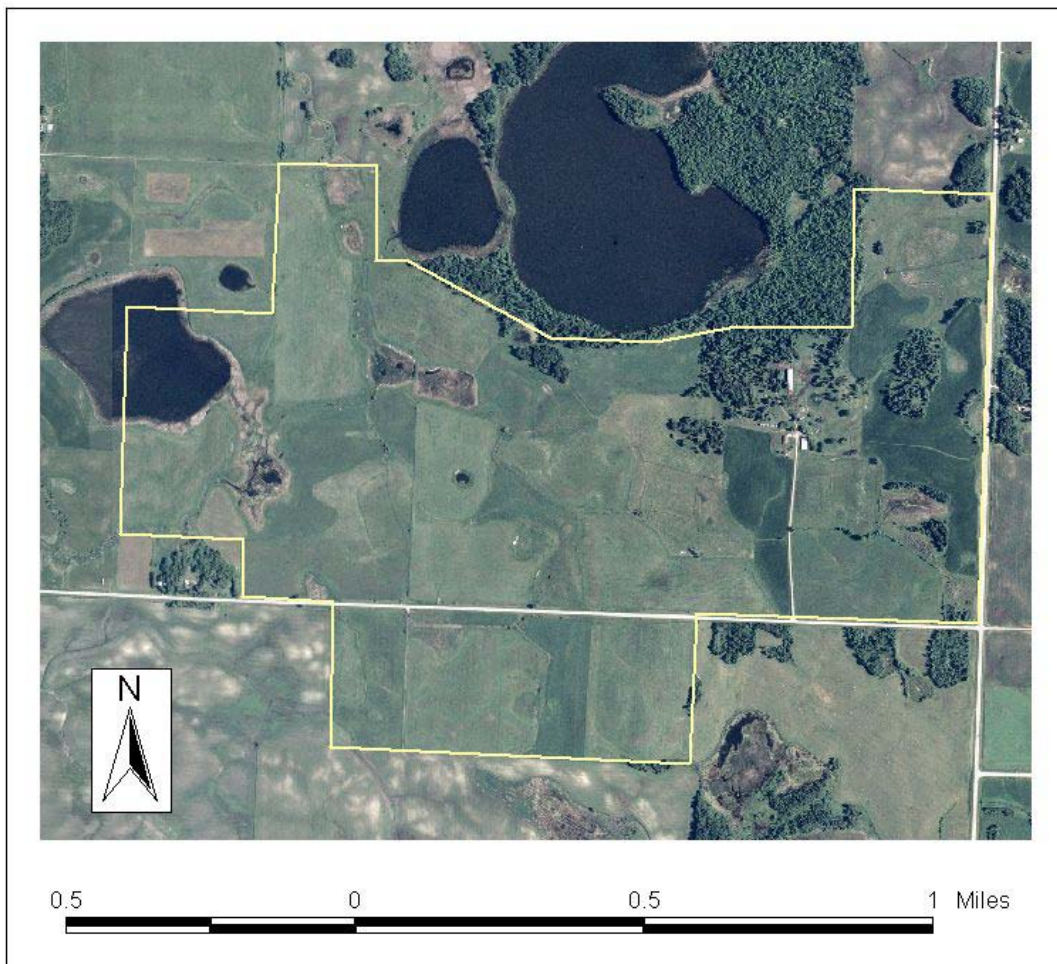
Figure 1. Location of Kruger WPA in northeast Becker County and an aerial photo of the site.