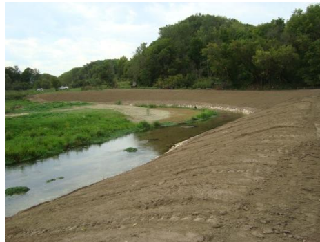
Rush Creek before and after work was performed.

Result #1: Working with private citizens and federal, county, and state agency employees we stabilized and improve habitat on over three miles of streams in Southeast Minnesota. Contractors were hired to work on incised channels to shape and reconnect the stream to their floodplains, with side slopes of 3:1 or better. Eroding