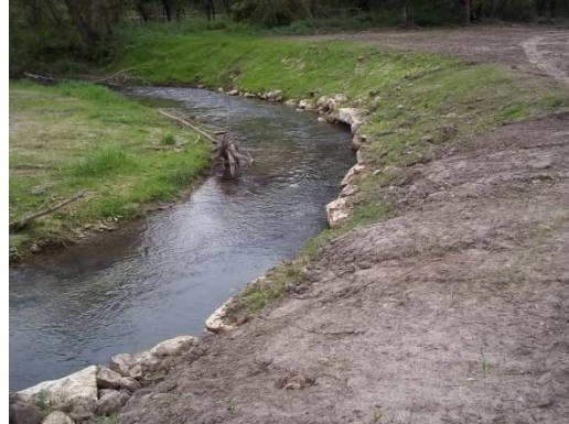
Hay Creek project before (left) and soon after (right).