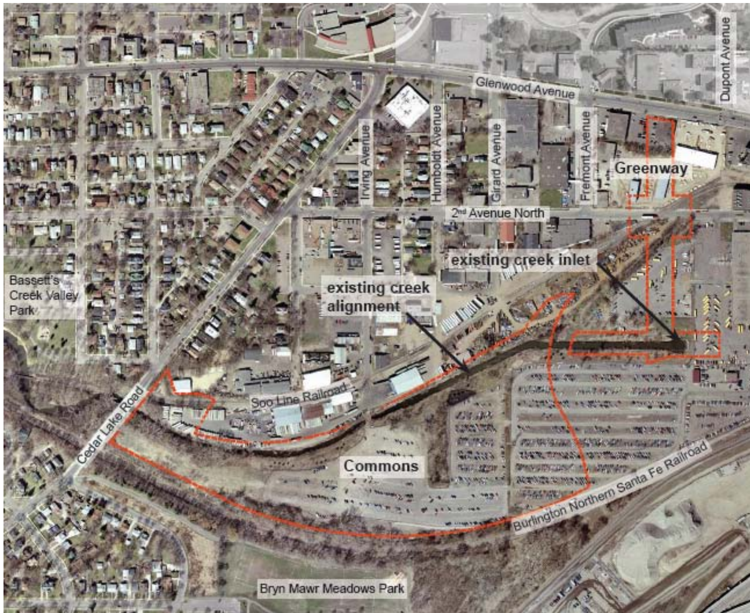
Project Location: Project areas, including the Commons and Greenway, are shown overlaid as red dashed lines on an aerial photograph.