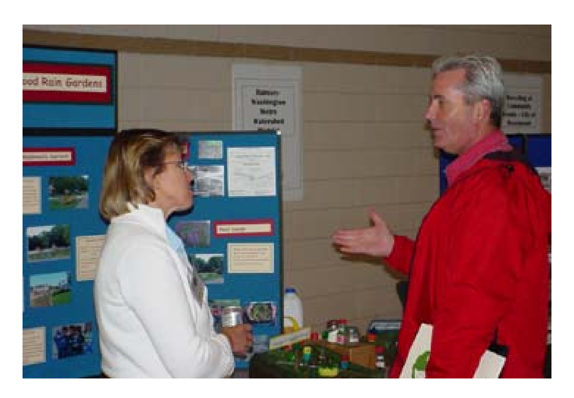
Best Practices Showcase at Natural Resources Workshop