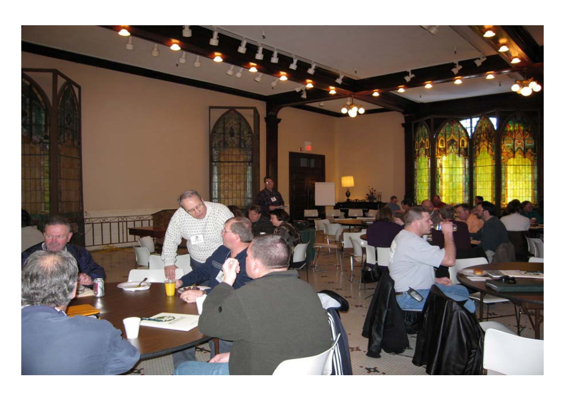
Working Session at Best Practices Workshop in Owatonna