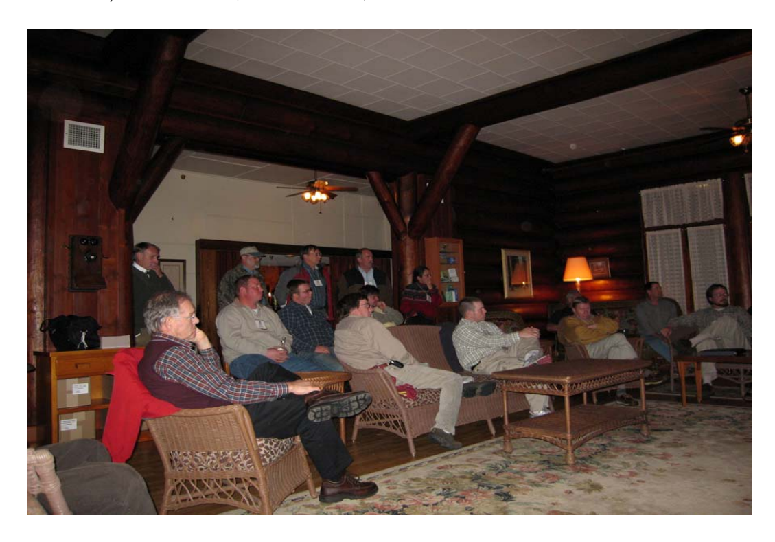
Best Practices Workshop at Itasca State Park, Fireside Best Practices Roundtable