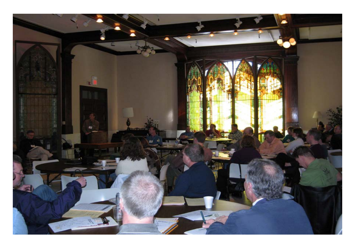
Best Practices Workshop in Owatonna