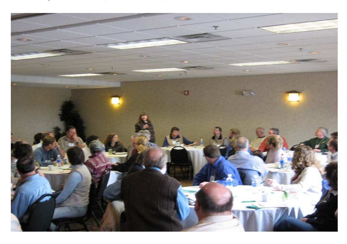
Group Discussion at Best Practices Workshop in Two Harbors