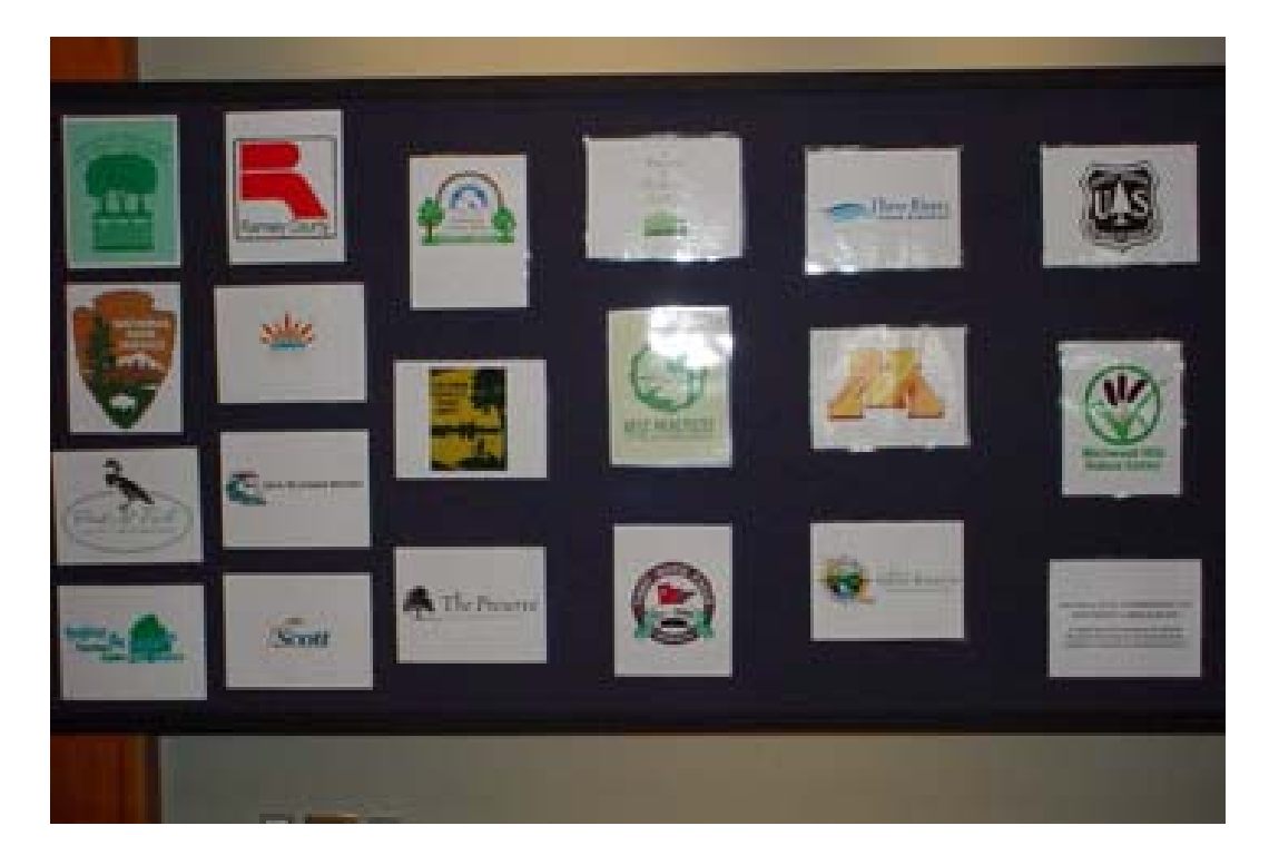
Summit Participant Logo Board