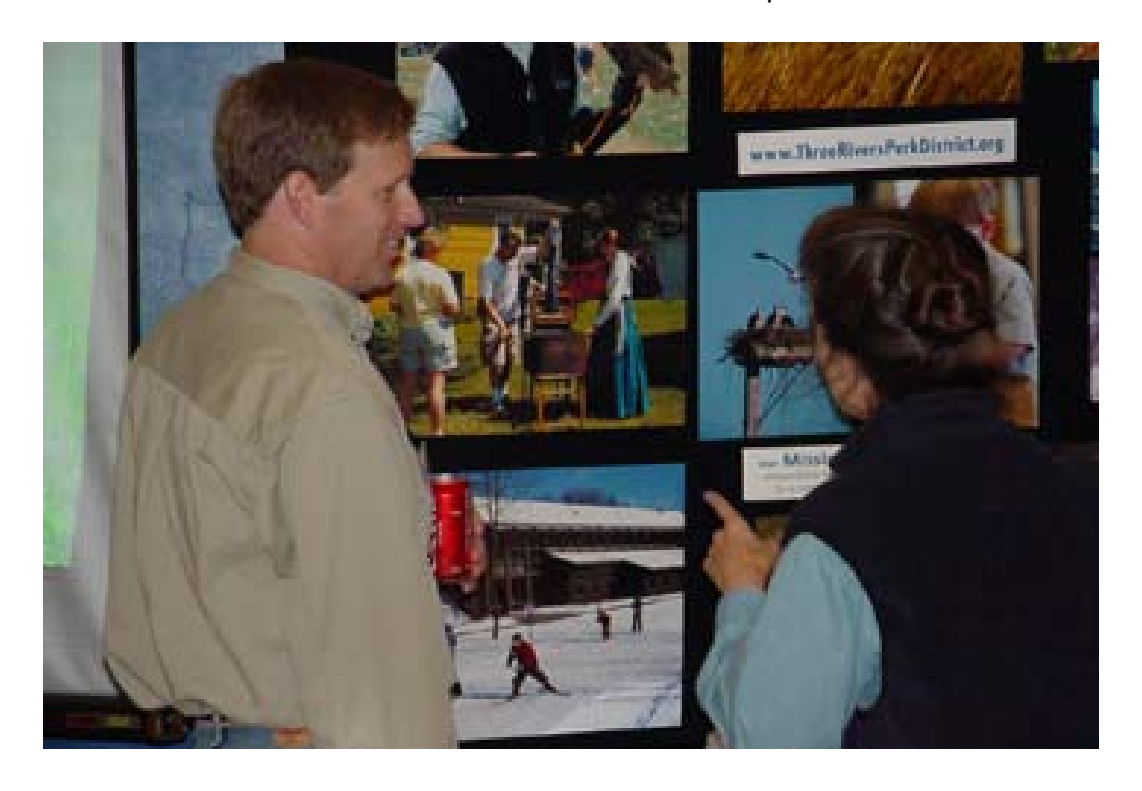
Best Practices Showcase at Natural Resources Workshop