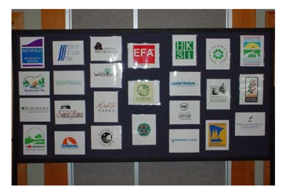
Summit Participant Logo Board