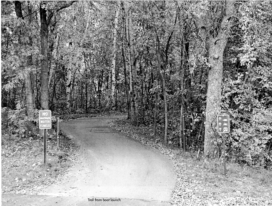
Trail from boat launch