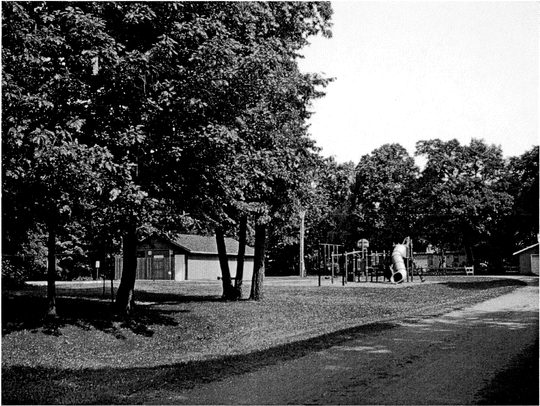
Lake Koronis Regional Park – Meeker and Stearns Counties