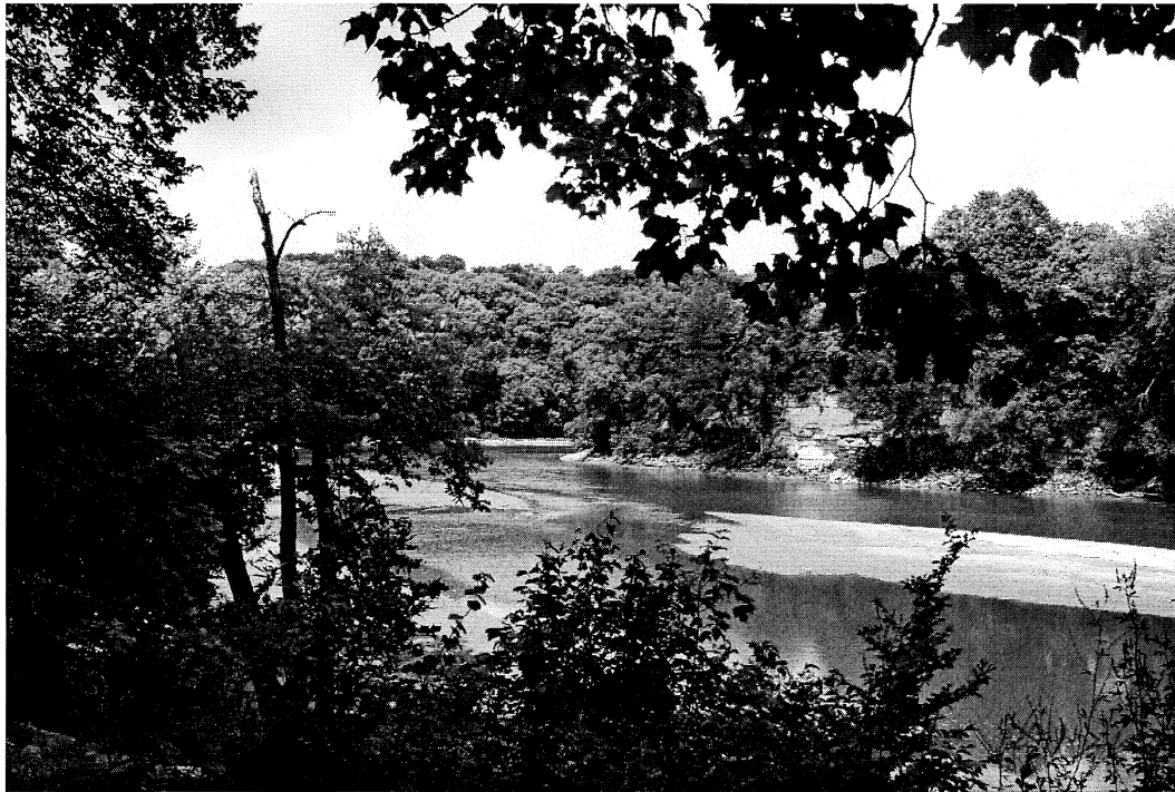
Rapidan Dam County Park – Blue Earth County