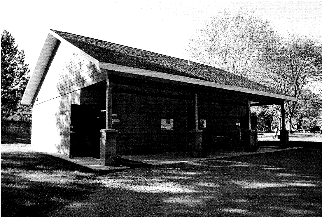
Oxbow Regional Park – Olmsted County