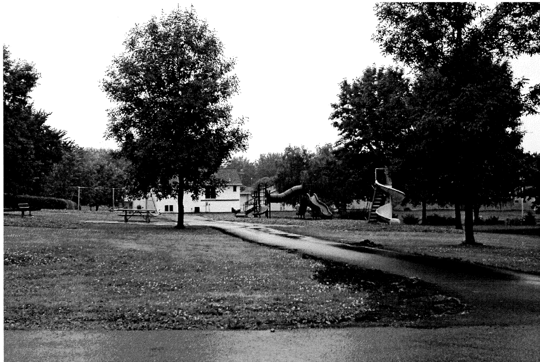
North Street Park – City of Janesville