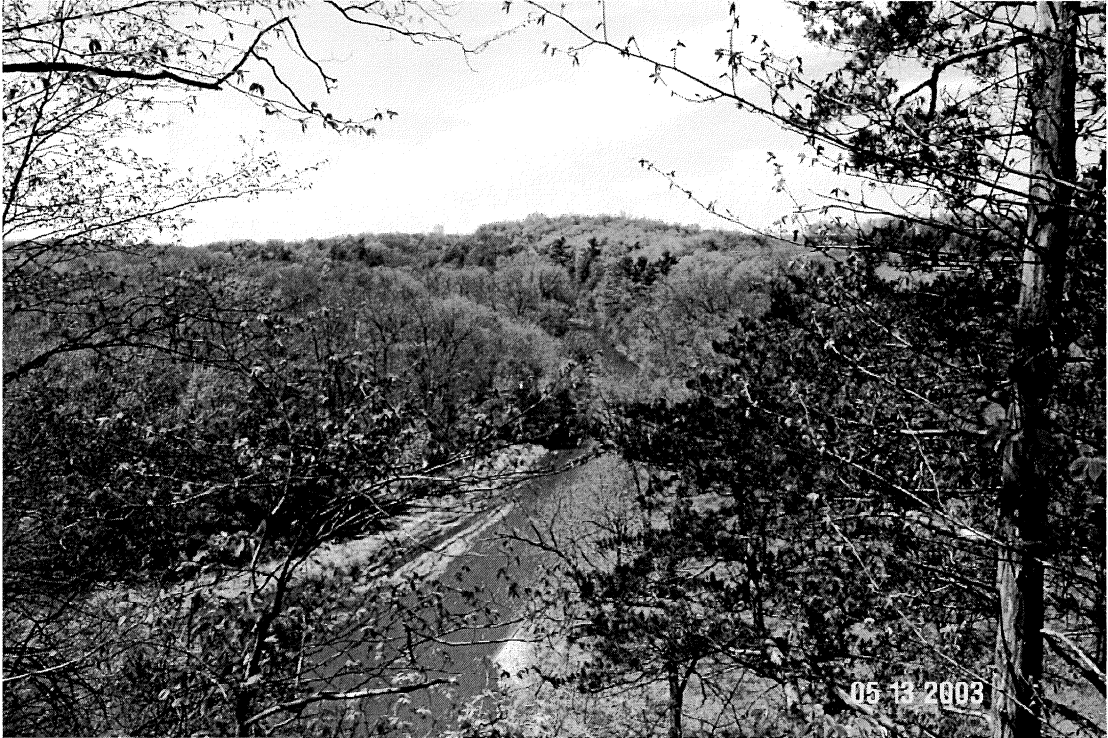
Fritz Property Acquisition – Olmsted County