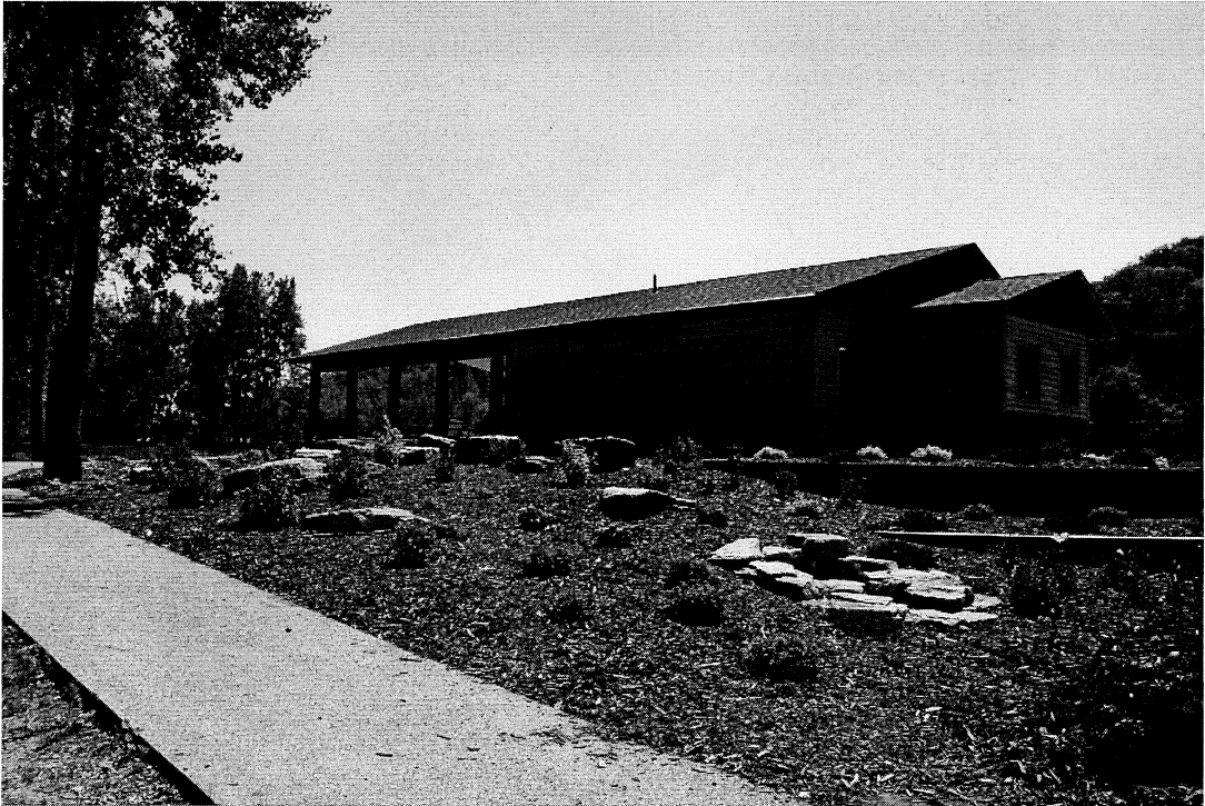
Kiwanis Park – City of Mankato