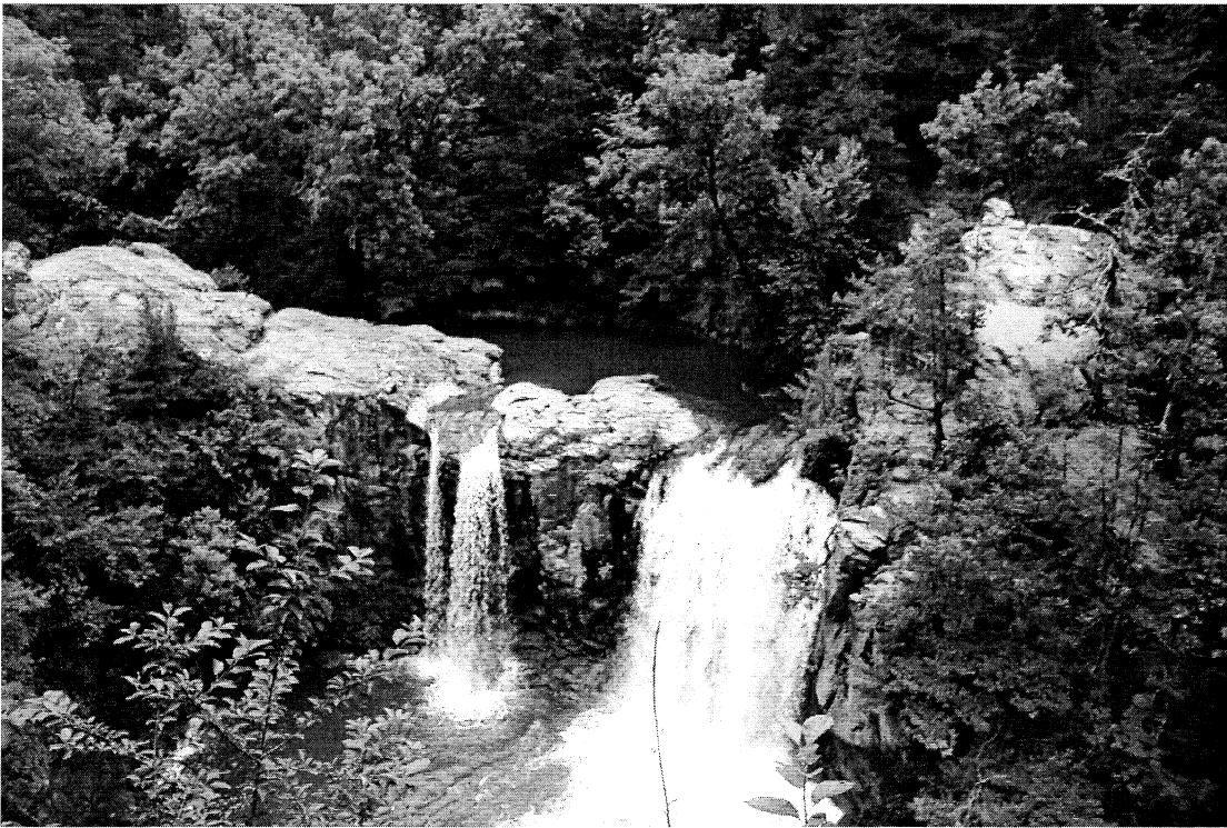
Alexander Ramsey Regional Park – City of Redwood Falls