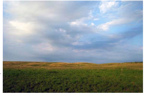
A 136 acre addition, partially funded by the ENRTF, to Blanket Flower Prairie Scientific and Natural Area in Clay County. The site straddles the western prairies and eastern deciduous forests of MN and contains a unique mixture of species [ML 2010: Complete].

stages of their timelines, 98 of which reached completion in 2013-14, including projects begun in 2008 (1), 2009 (5), 2010 (33), 2011 (56), 2013 (2), and 2014 (1).