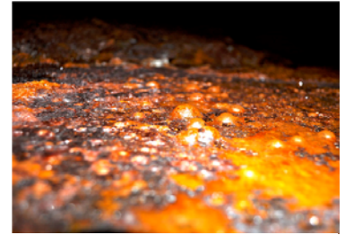
Iron oxide mats in Soudan Underground Mine State Park. Unique properties of microorganisms living in this ecosystem are being studied for applications in bioremediation, bioenergy, and for biocontrol of white nose syndrome in bats [ML 2010: Complete; ML 2013: Underway].

Other: ~$1.1 million for FY 2014-2015 LCCMR administration ($990,000) and contract agreement reimbursement services for projects by non-state entities ($135,000).