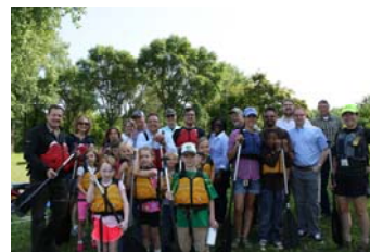
LCCMR experiencing ENRTF-funded initiative providing disadvantaged youth with hands-on outdoor education and recreational experiences—LCCMR site visit, 07/29/14 [ML 2010: Complete; ML 2013: Underway; ML 2014: Underway].