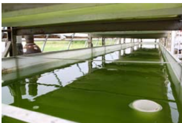
Algae being grown using nutrients in wastewater for biofuel production—part of a multi-phase ENRTF-funded U of MN research effort in partnership with public utilities and private industry—LCCMR site visit, 07/29/14 [ML 2010: Complete; ML 2014: Underway].

In 2013-14, the LCCMR engaged in several activities that informed its priorities for the projects it recommended for funding to the 2013 MN Legislature. Natural resources sites around the state were visited: