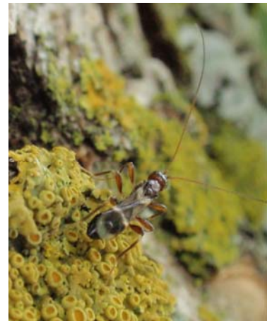
Tetrastichus planipennis , a type of wasp that parasitizes emerald ash borer (EAB) - ENRTF funded efforts are releasing this wasp in MN as an approved biocontrol for EAB [ML 2011: Complete; ML 2014: Underway].