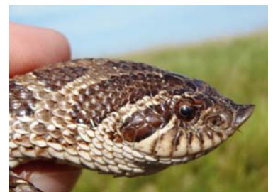
Plains hognose snake ( Heterodon nasicus ), a species of concern in MN found at widely scattered locations in a limited number of counties in the state. The MN Biological Survey, funded by the ENRTF since 1991, has done extensive surveying for the species [ML 2011: Complete; ML 2013: underway, ML 2015: Recommended].

MN Soil Survey Completion [ML 2011: Complete]: County-by-county analysis and mapping of the state's soils providing critical data for protecting and managing MN habitat, wetlands, and water resources. The ML 2011 funding completed a multi-decade effort to update and digitize the survey for the entire state.