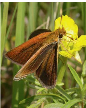
Poweshiek Skipperling ( Pediomelum esculentum)—a native MN prairie butterfly recently listed as an endangered species. An ENRTF project attempting to protect this species is one of seven pollinator related ENRTF projects begun in 2013-2014 [ML 2014: Underway].

Other: ~$100,000 for ENRTF project administration and data management improvements and $135,000 for contract agreement reimbursement services for projects by non-state entities.