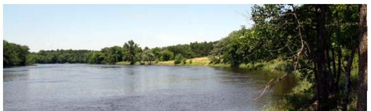
23 acres in additions, funded by the ENRTF, to Crow Wing State Park, providing additional recreational opportunities and shoreline protection for the Crow Wing River—LCCMR site visit, 07/17/13 [ML 2010: Complete; ML 2011: Underway].