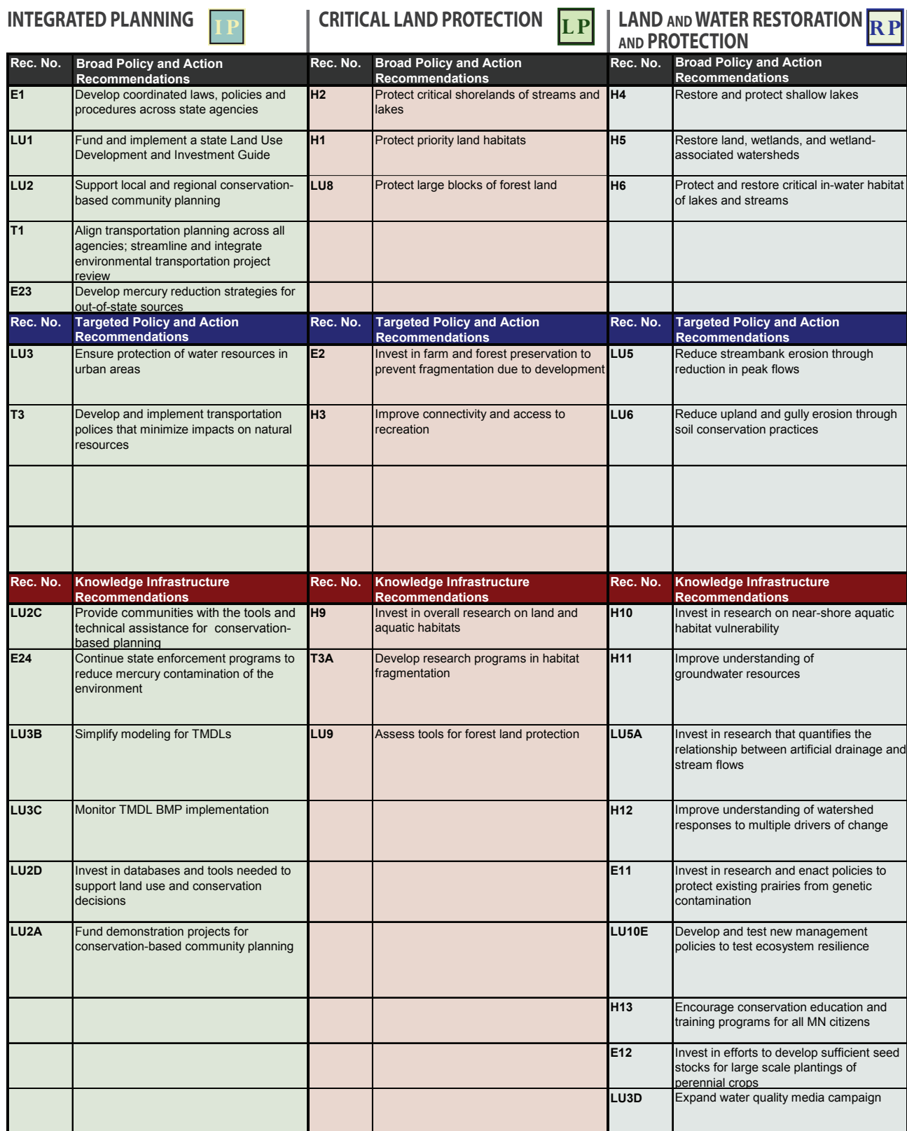
Figure 3. Strategic framework for integrated resource conservation and preservation