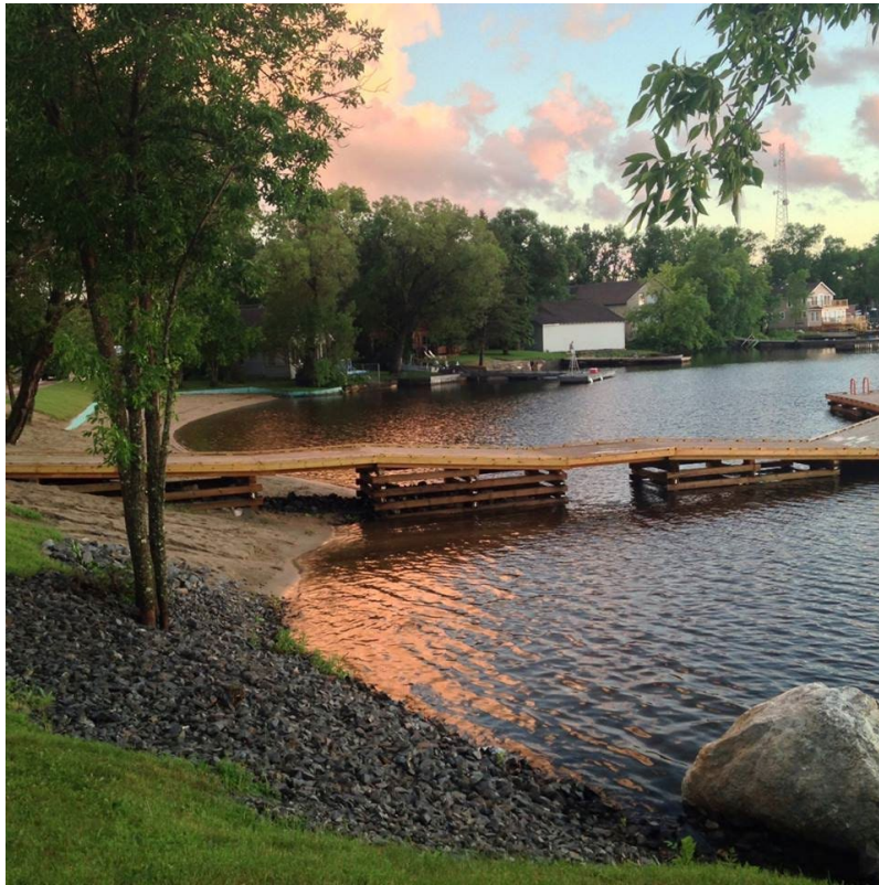
Photo of Lake Ranier beach