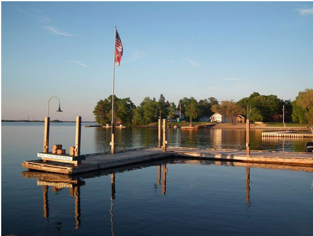
Photo of Lake Ranier dock