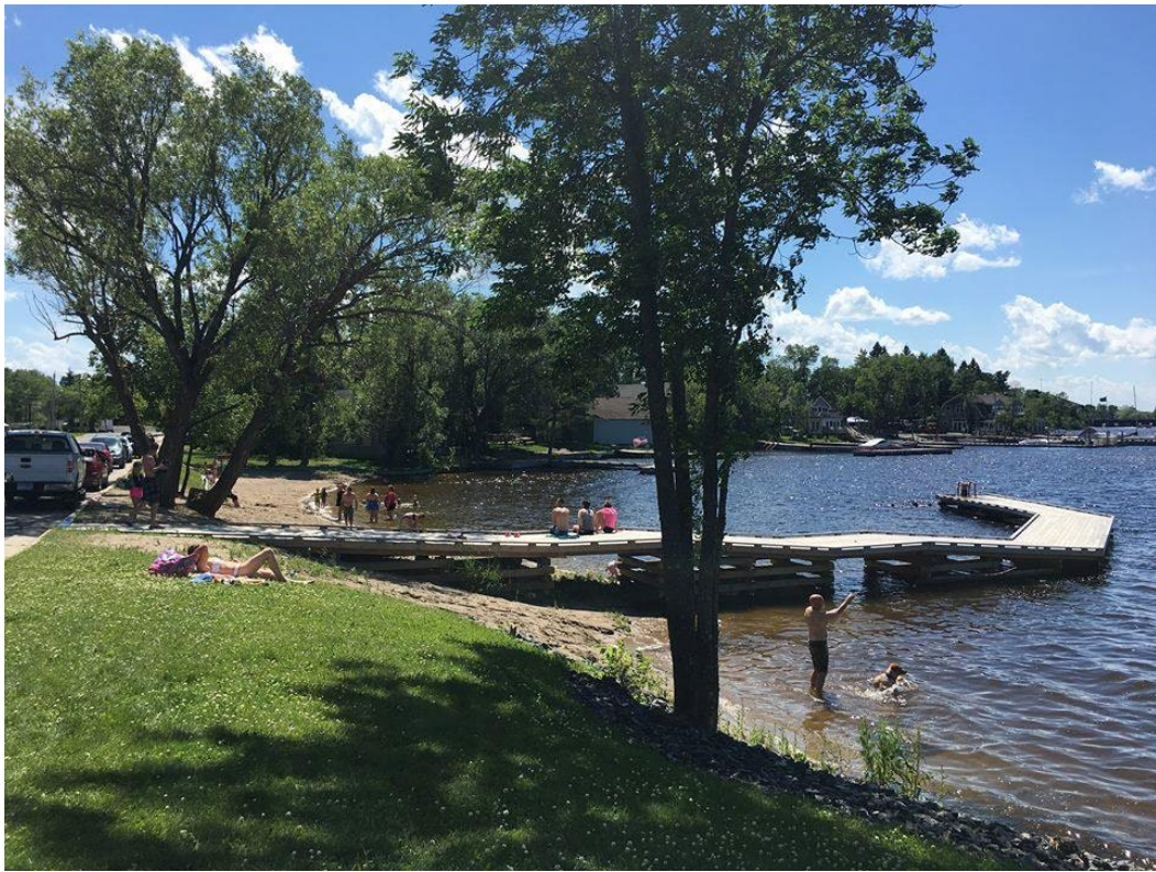
Photo of Lake Ranier beach