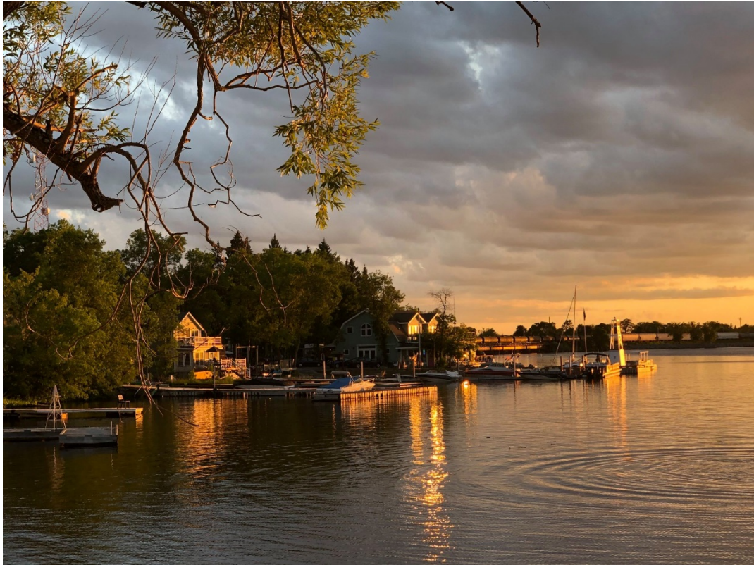
Photo of Lake Ranier shoreline