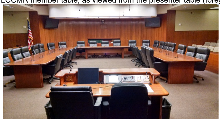
Typical LCCMR member table, as viewed from the presenter table (foreground):

If you are using a PowerPoint presentation, it will be pre-loaded onto the laptop that will be connected at the presenter table. The presentation will be projected onto three screens visible to the audience and members. The presenter will be able to advance their presentation using the lap top provided.